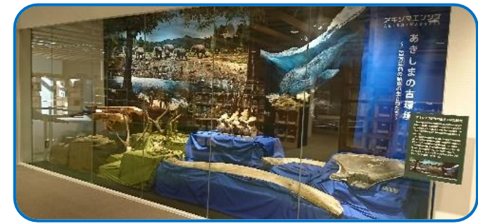
A. Palaeoenvironment of Akishima: Local Creatures Dating Back 2 Million Years