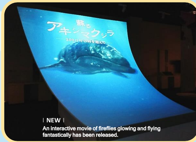
| NEW | An interactive movie of fireflies glowing and flying fantastically has been released.

Using the 86 inch touchscreen, the information of the attractive historical sites and nature is accessible, arranged by area and period.