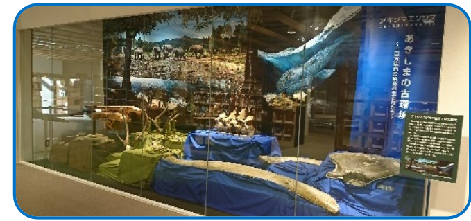
A. Palaeoenvironment of Akishima: Local Creatures Dating Back 2 Million Years