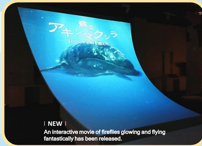
| NEW | An interactive movie of fireflies glowing and flying fantastically has been released.

Using the 86 inch touchscreen, the information of the attractive historical sites and nature is accessible, arranged by area and period.